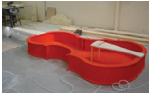
Big Ffidil during construction

Festival Reception (a short walk from WMC)