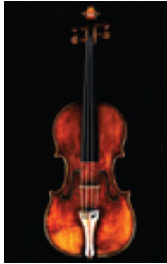
Stradivarius 1725 violin "Wilhelmj"

6.45-7.05pm | St David's Hall auditorium