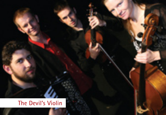
The Devil's Violin